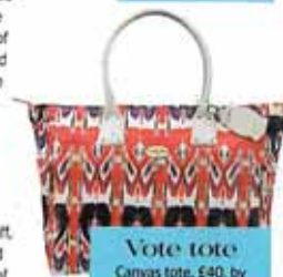
Vote tote Canvas tote, £40, by Jasper Conran, at Tripp