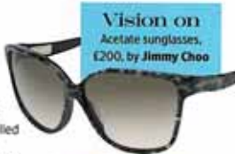
Vision on Acetate sunglasses, £200, by Jimmy Choo

old Levi's and great little dresses. Where do you hang out? Lincoln Road – there are no cars and it's filled with art galleries and restaurants. There is a diverse mix, from models to actors to dancers to crazy people. Your favourite bar? It has to be the bar by the Shore Club swimming-pool. There are cabanas with Thai-style daybeds, flowing white curtains and beautiful lanterns. It gets going at around three in the afternoon; there'll be 200 people dancing in the water – it's a wild scene to watch. It's also right next to Nobu, so you can nip in for sushi or black cod afterwards. The best restaurant? Casa Tua – it's like being in someone's house. The owner, Miky Grendene, is a friend of mine from Milan, so he knows good Italian food. I order the pasta of the day and rocket salad, and then we go up to the terrace for pudding. What do you miss when you're not there? Everything – the good-looking people, the fun restaurants and especially the weather. I like wearing summer stuff, a pair of jean shorts or a kaftan and flip-flops. I can't bear the layering of winter clothes. I love swimming in the ocean every day – it energises me.