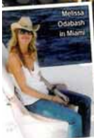
Melissa Odabash in Miami