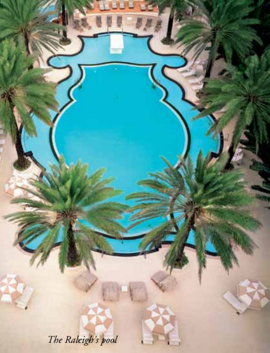
The Raleigh's pool