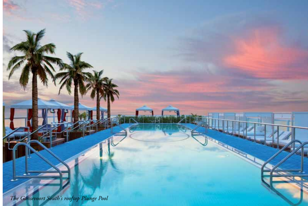
The Gansevoort South's rooftop Plunge Pool

also light and healthy. Packed at night, the bar serves deliciously crafted cocktails, and, as we've come to expect from Mr. Chow, the celeb-spotting can't be overstated.