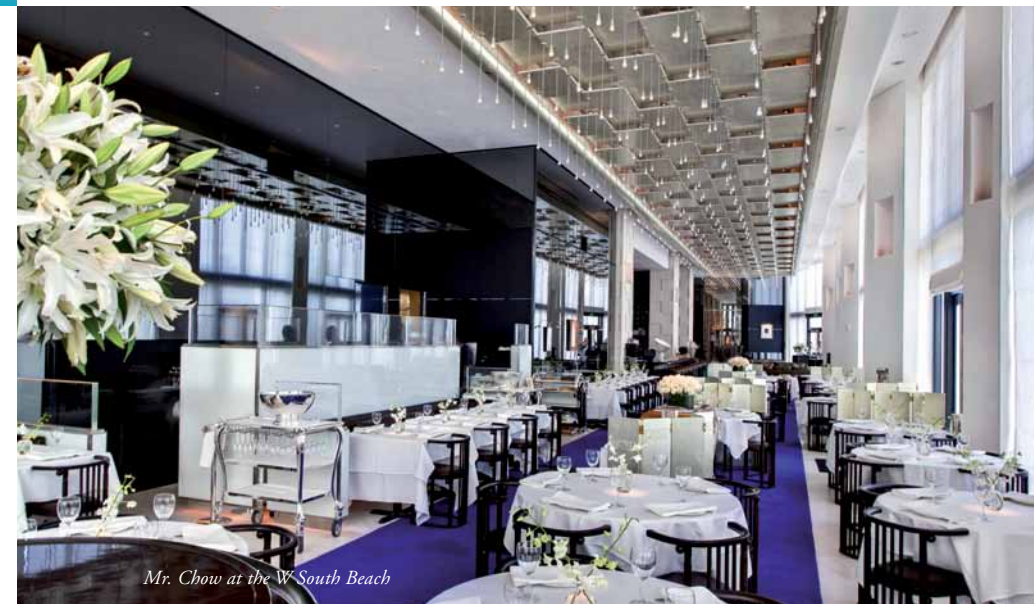
Mr. Chow at the W South Beach

whimsical, sumptuous interior, and boasts dramatic views of the city and surrounding harbors from the sleek pool deck. It is from here, 50 stories up, that you might start to understand the scale and achievement of Miami's art and architecture over the years. And who knows? You may see all the way to the old Breakwater Hotel, its illuminated block letters heralding like a Hollywood marquis. ERIKA MEHIEL