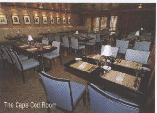
The Cape Cod Room

Nosh on homemade pastas and brick-oven-baked pizzas at Joey's , known for its warm and friendly vibe and gentle prices (even valet parking is free!). 2506 NW Second Ave., Miami, 305-438-0488; joeyswynwood.com ... Afterward, head to Bardot , the brand-new, clandestine speakeasy that nods to the Swinging '60s London rock scene. 3456 N. Miami Ave., Miami, 305-576-5570; bardotmiami.com